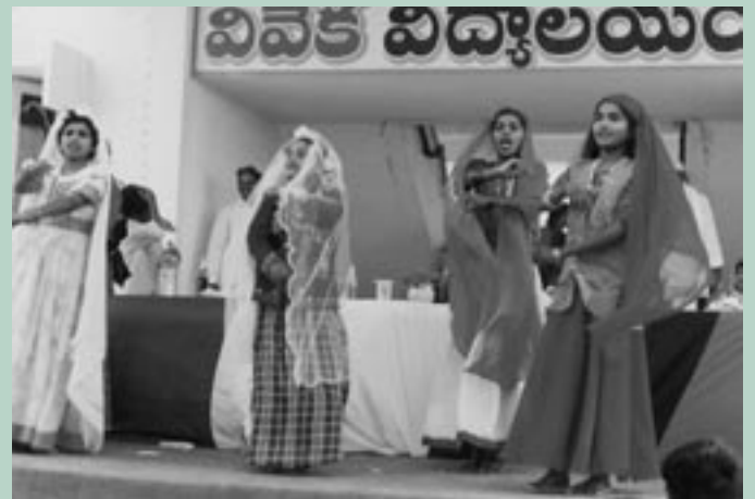
Viveka Vidyalayam celebrations

The first step for Viveka Vidyalayam was to establish a child-centred learning process, where the child is respected by teachers as an individual, with his or her own pace of learning. The teacher, rather than the child, is made responsible in greater measure