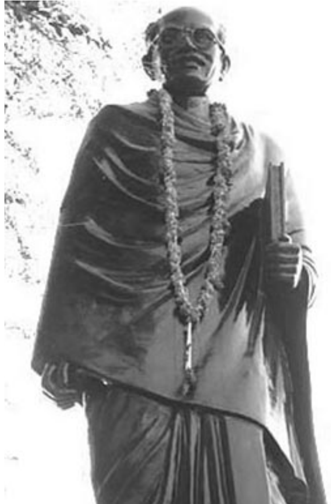
Rationalism past: Tripuraneni Ramaswamy

In the centre of the Hussain Sagar Lake, on the other side of the promenade, is a 72-foot-high, 450-tonne, monolithic white granite statue of the Buddha, reminding the visitor of the region’s Jain and Buddhist heritage. Nagarjuna, the second century AD founder of the Madhyamika School of Buddhism was born here. Andhra Pradesh was an important ancient centre of Buddhist learning. One half of the Amaravati Stupa was removed by the colonizers and can be found today in the British Museum in London.