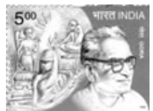
Indian postage stamp honouring Gora